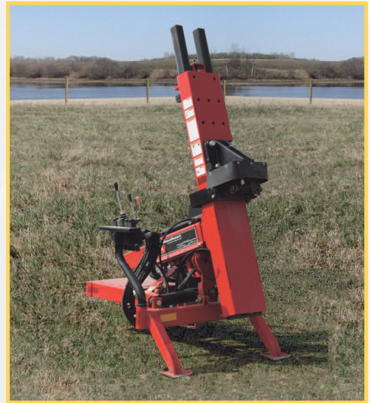
3pt Hitch Side Mast