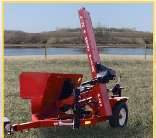
Trailer Model Plus