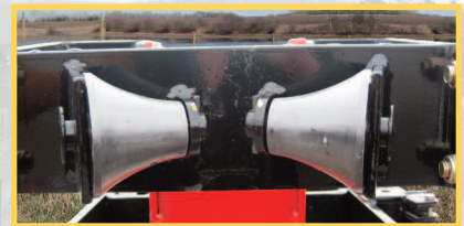
Cast Iron Cones