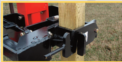
Square Post Hugger