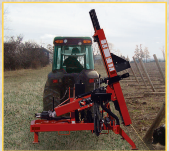
3pt Hitch Side Mast

3pt Hitch Models are free standing for additional safety while attaching or detaching from the tractor and offers a PTO driven self-contained hydraulic system.