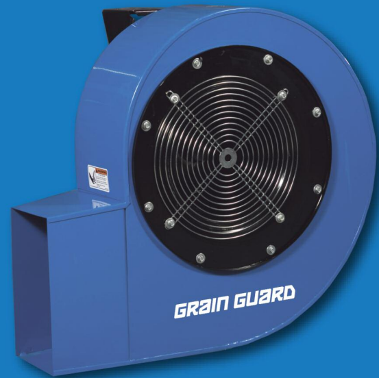
Fan Performance: Airflow (CFM) at Static Pressure (In. Water Guage)